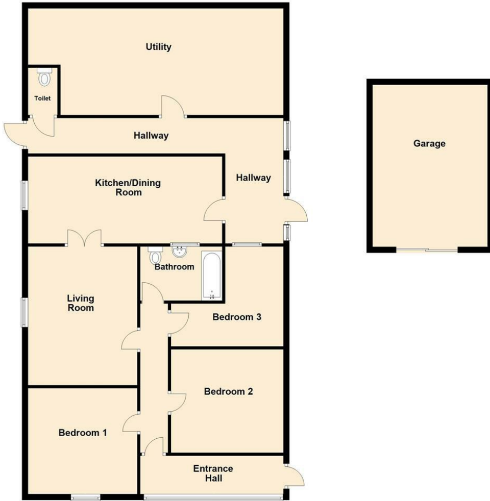
Total area: approx. 163.8 sq. metres (1763.2 sq. feet) Clun View, Trelech, Carmarthen